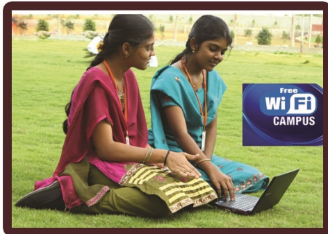
WI-FI ENABLED CAMPUS

College Bus Services are available for Puthur, Thalavaipuram, Seithur, Murambu, Rajapalayam, Alangulam, Srivilliputhur, Mamsapuram, Sattur, Padanthai, Sadaiyampatti, Thayilpatti* . (*Under Consideration)