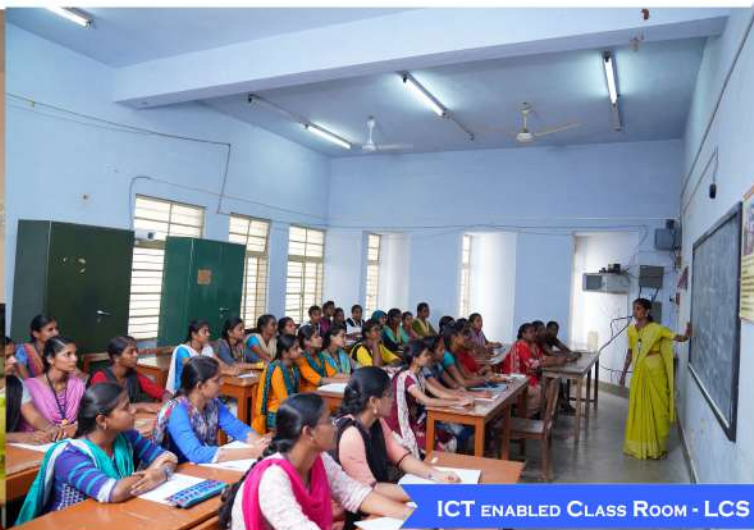
ICT ENABLED CLASS ROOM - LCS