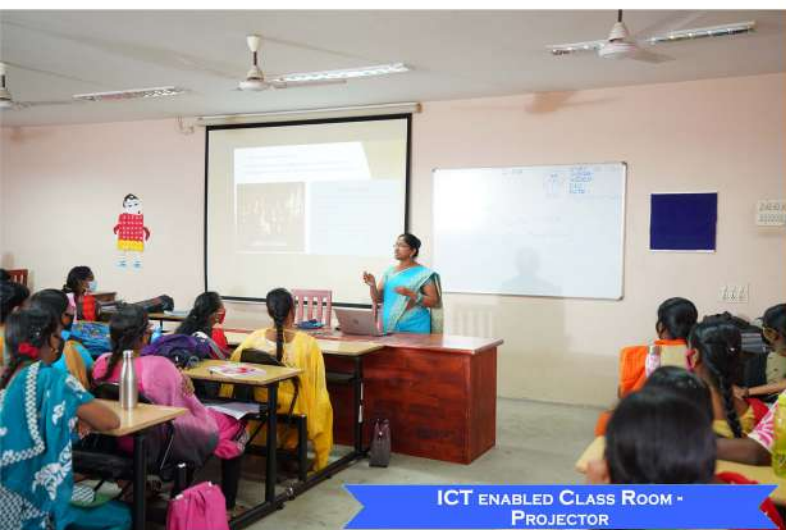
ICT ENABLED CLASS ROOM - PROJECTOR